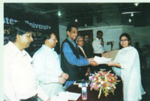
Minister Awarding Scholarships