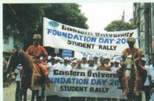
Foundation Day Rally