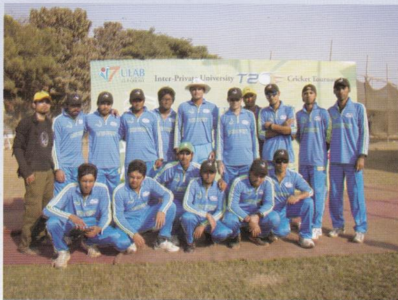
EU Cricket team participated in ULAB Fair Play Cricket Tournament.