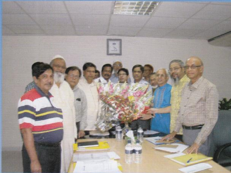
Reception of new Vice Chancellor by BOT members.