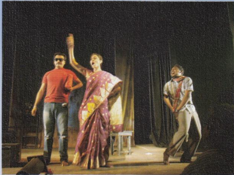
Drama "Kenaram, Becharam" staged by the EU Drama & Theatre Club.