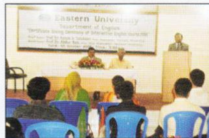
A glimpse of the Certificate Giving Ceremony