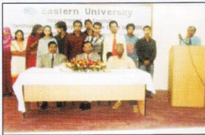
The participants of the Interactive English Course along with the Pro-VC, EU, the Vice Chancellor, EU and the Dean, Faculty of Arts.