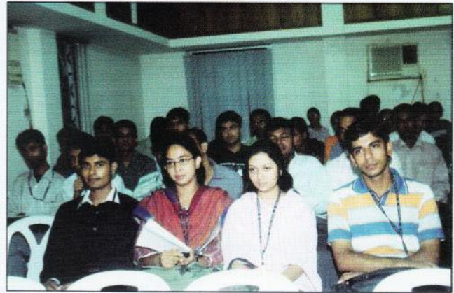
A view of the audience attending the program