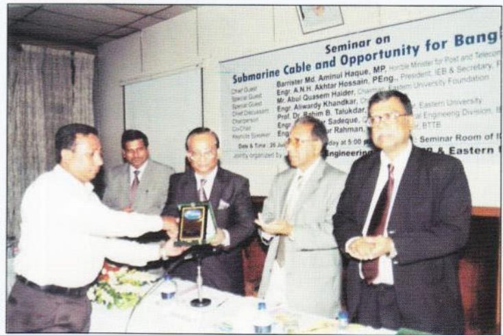
A view of the seminar: the Vice Chancellor and the Pro-Vice Chancellor, EU, along with other guests