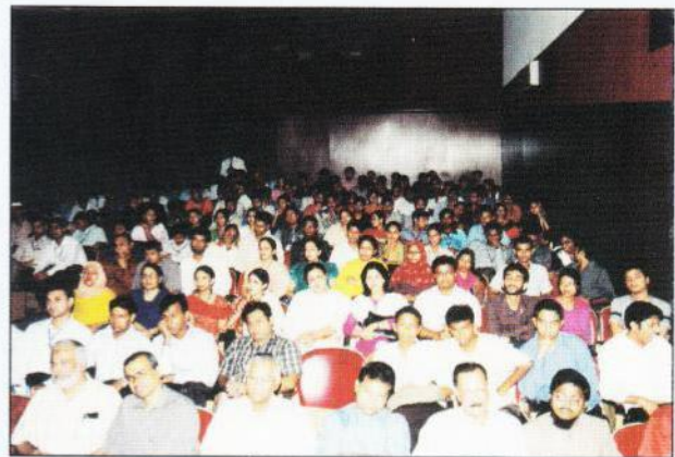
A glimpse of the audience