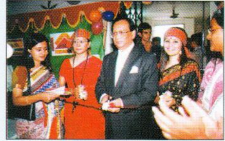
A view of the Baishaki Mela