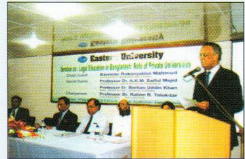
A view of the Seminar