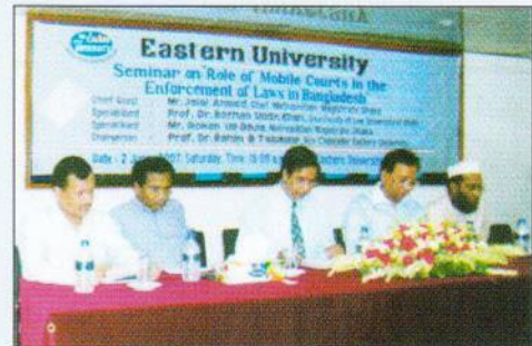
A view of the Seminar