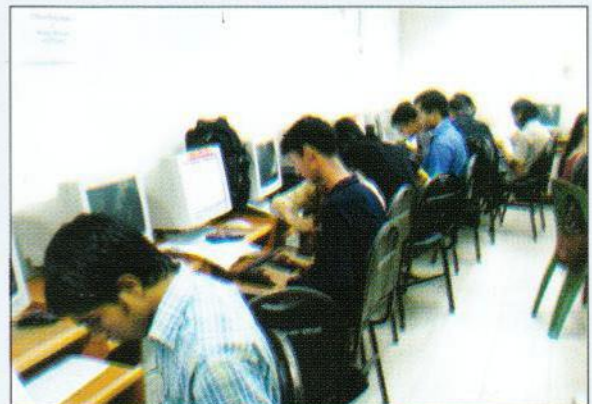
Students in the Programming Contest