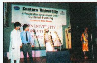
A scene from the Cultural Function