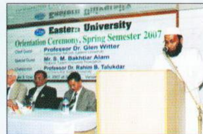
A view of the Orientation Ceremony