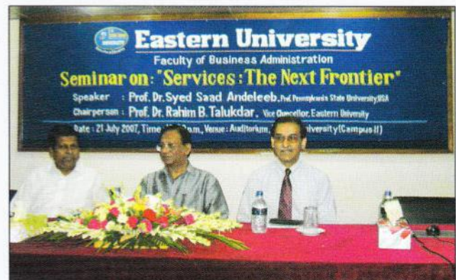
A view of the Seminar