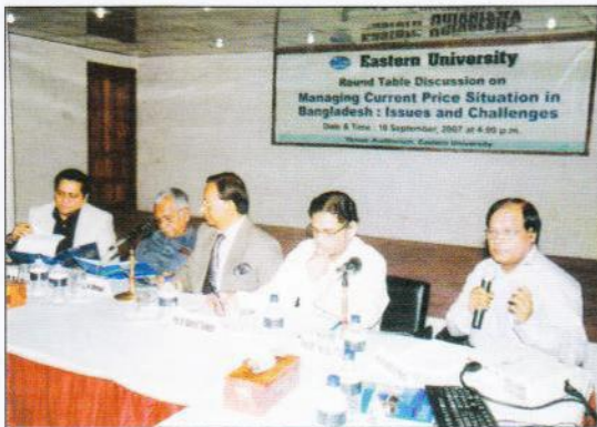
A view of the Round Table Discussion