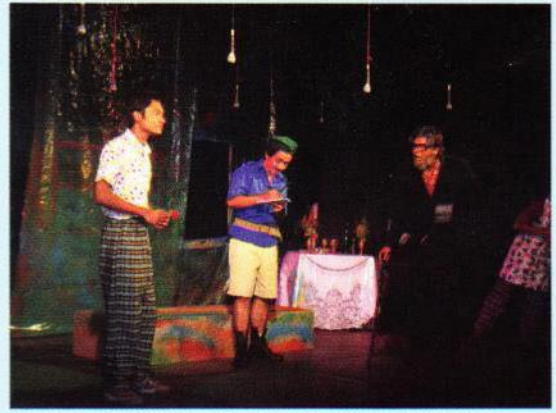
Drama at British Council