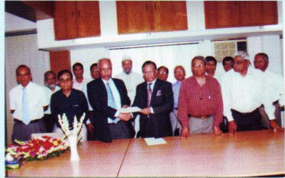
MoU Signature Ceremony